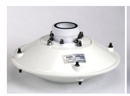
Screw flange (standard)