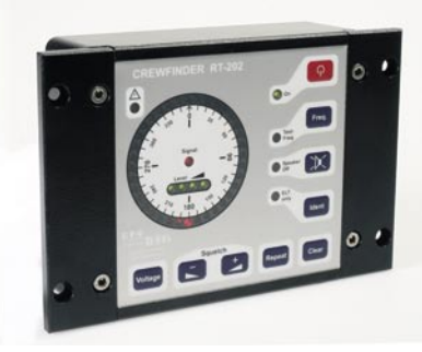
Aluminum housing with panel mounting brackets