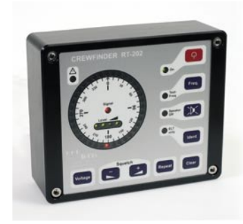
POM housing (standard)